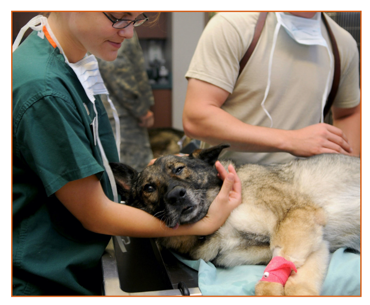
Relapses are common, despite appropriate therapy.

Typically, therapy consists of appropriate antifungal medications, pain relief, and needed supportive care, such as intensive care monitoring and oxygen supplementation for dogs with difficulty breathing. Dogs with neurologic disease and severe lung disease have a more guarded prognosis. Ocular (eye) involvement will require aggressive care to try and save the eye, with the understanding that in some dogs, surgical removal of the eye (enucleation) may be advised to prevent the infection from spreading to other body locations.